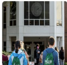
Non-Degree Student Advising