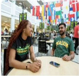
Academic Planning & Registration