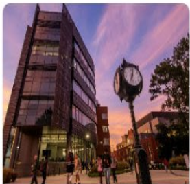
Exploratory Academic Advising