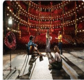
Majors and Minors: Explore, Change, Add