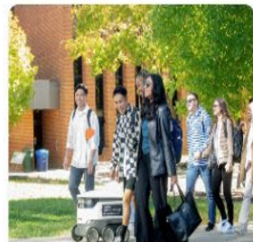
Transfer Student Advising