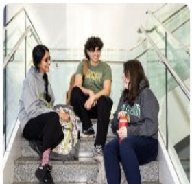
First-Year Student Advising