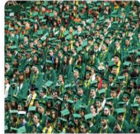
Change of Major