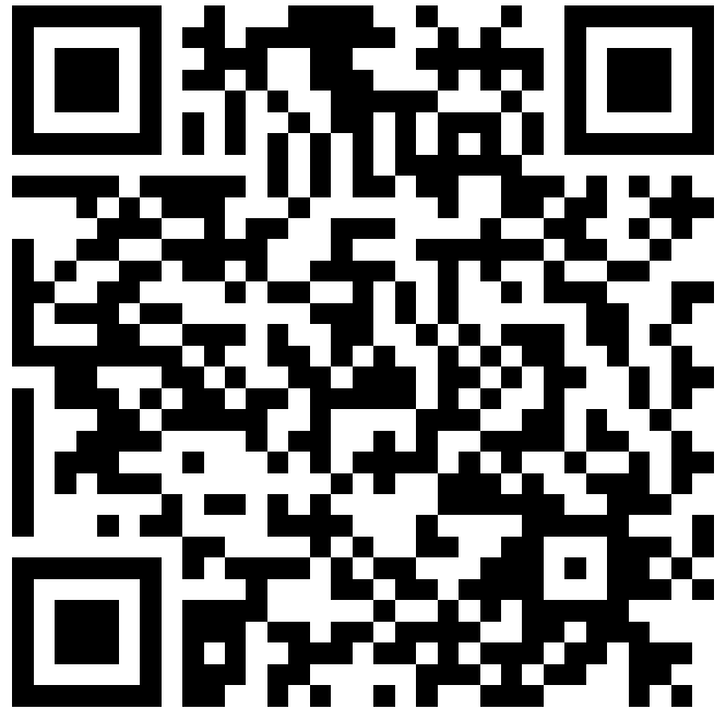
MANDATORY ORIENTATION FORM FOR MASTER'S STUDENTS